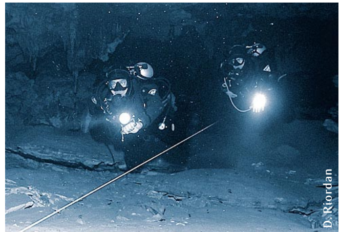
Proper formation is essential for good communication

An important element of navigation is the need to look ahead and pay particular attention to what is approaching. When teaching cave divers, instructors try to coach their students to look ahead of them as far as they can see. This helps them to prepare for restrictions, to anticipate changes in depth, and to prepare for entering silty areas; it also facilitates passive communication, and helps establish points of reference.