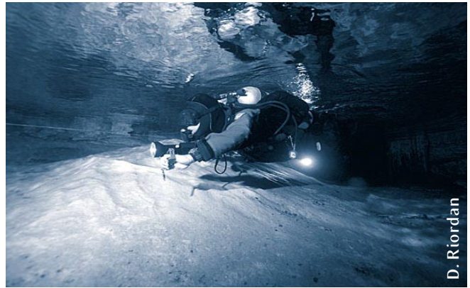
Passive communication is an important component of underwater communication

Passive communication allows team members to constantly monitor each other’s state. By keeping their light beams in the field of vision of another team member, individuals are automatically communicating their presence and their general condition.