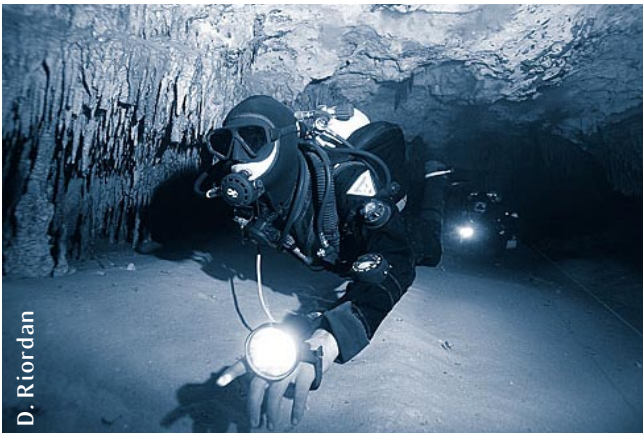
Good buoyancy and trim is essential to cave diving

Proper equipment configuration, coupled with horizontal trim, good buoyancy control and adequate propulsion techniques, are key elements to prevent unnecessary stress on the line. Crossing and positioning oneself under the line could possibly lead to severe entanglement in the manifold assembly, which is by far the worst part of the equipment to get snagged. A prone position ensures effective hydrodynamics and facilitates efficient referencing.