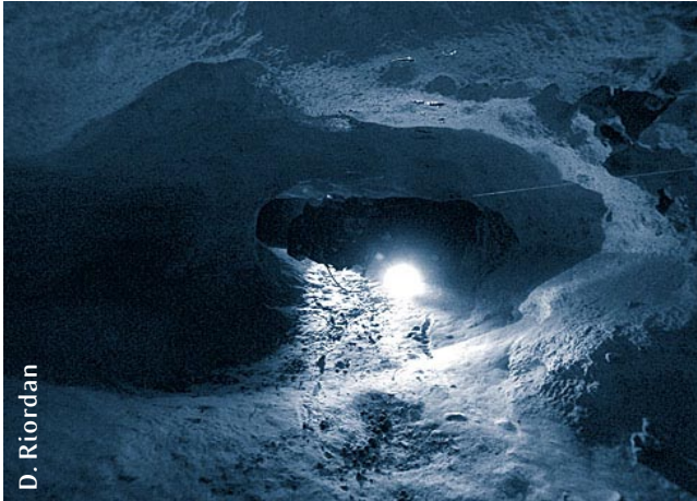
Back referencing is a good habit to get into

It is also a good practice to periodically look back and familiarize yourself with how the environment will look on your return trip. This is known as “back-referencing” and is particularly important at restrictions or other navigational challenges. The exit portion of a dive may present limited visibility, and a mental image of key areas can facilitate an efficient return.