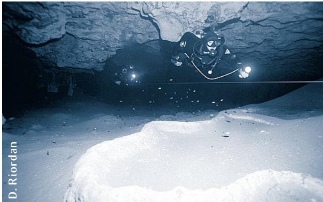
Proper line following is critical when cave diving