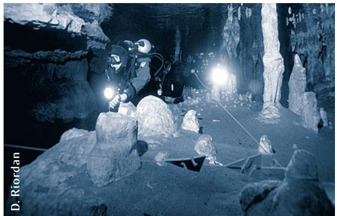
It is important that divers not cut corners

Self-sufficiency is important in building a strong and efficient team, and navigation is an essential part of this. One cannot rely on another team member not to make a mistake. In fact, what makes a proficient team is the ability for each team member to bring forth his or her individual competence and awareness.